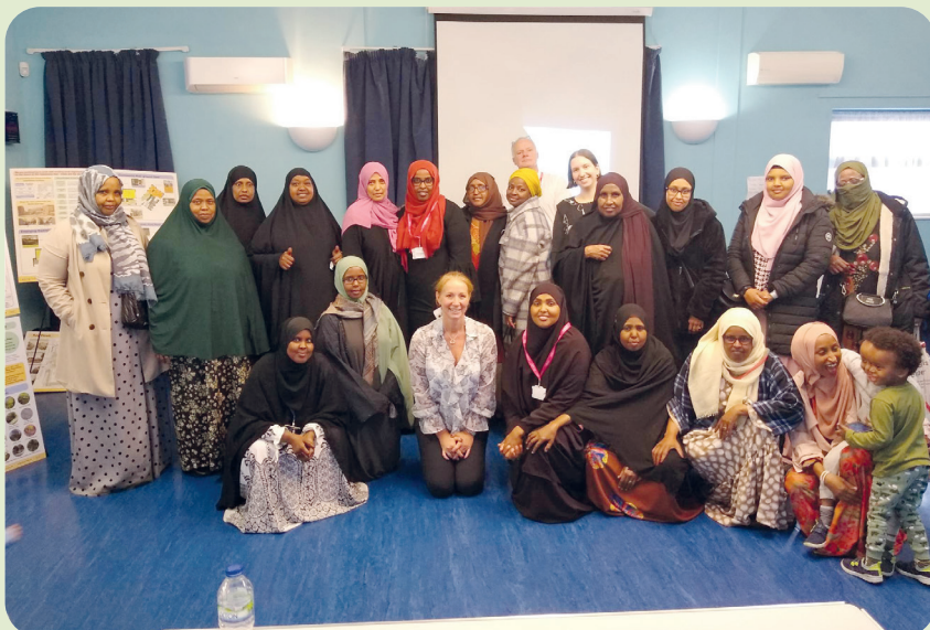
The project team and Midaye members.

At the W12 Together summer festival we connected with other local community organisations including Midaye, a group which runs a range of community-led projects and activities for Black, Asian and Multiethnic communities in W12 and the local area.