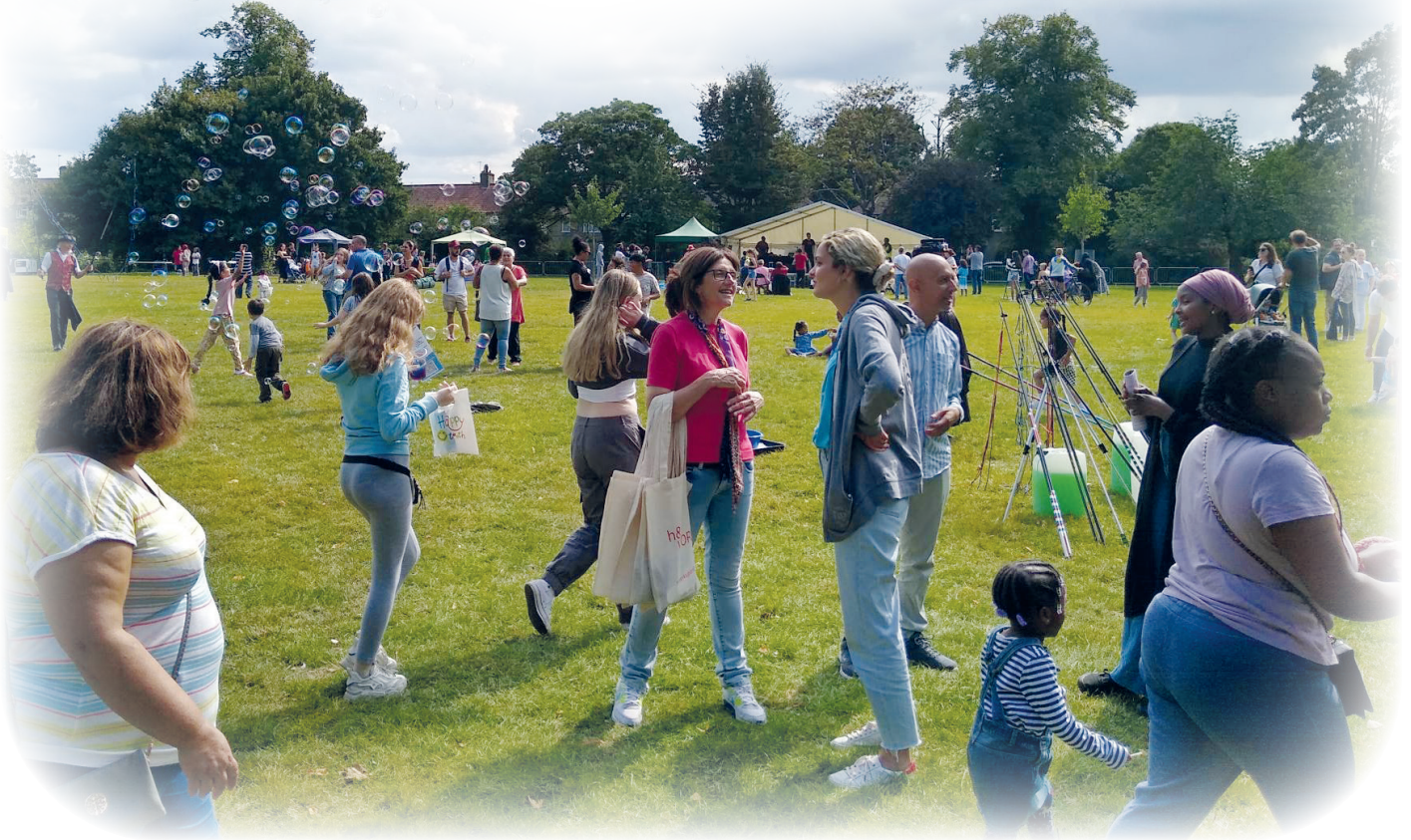
Local residents at the W12 Together's Summer Festival.

Many of you told us you preferred the new Bridget Joyce Square design as it provides more space for pedestrians.